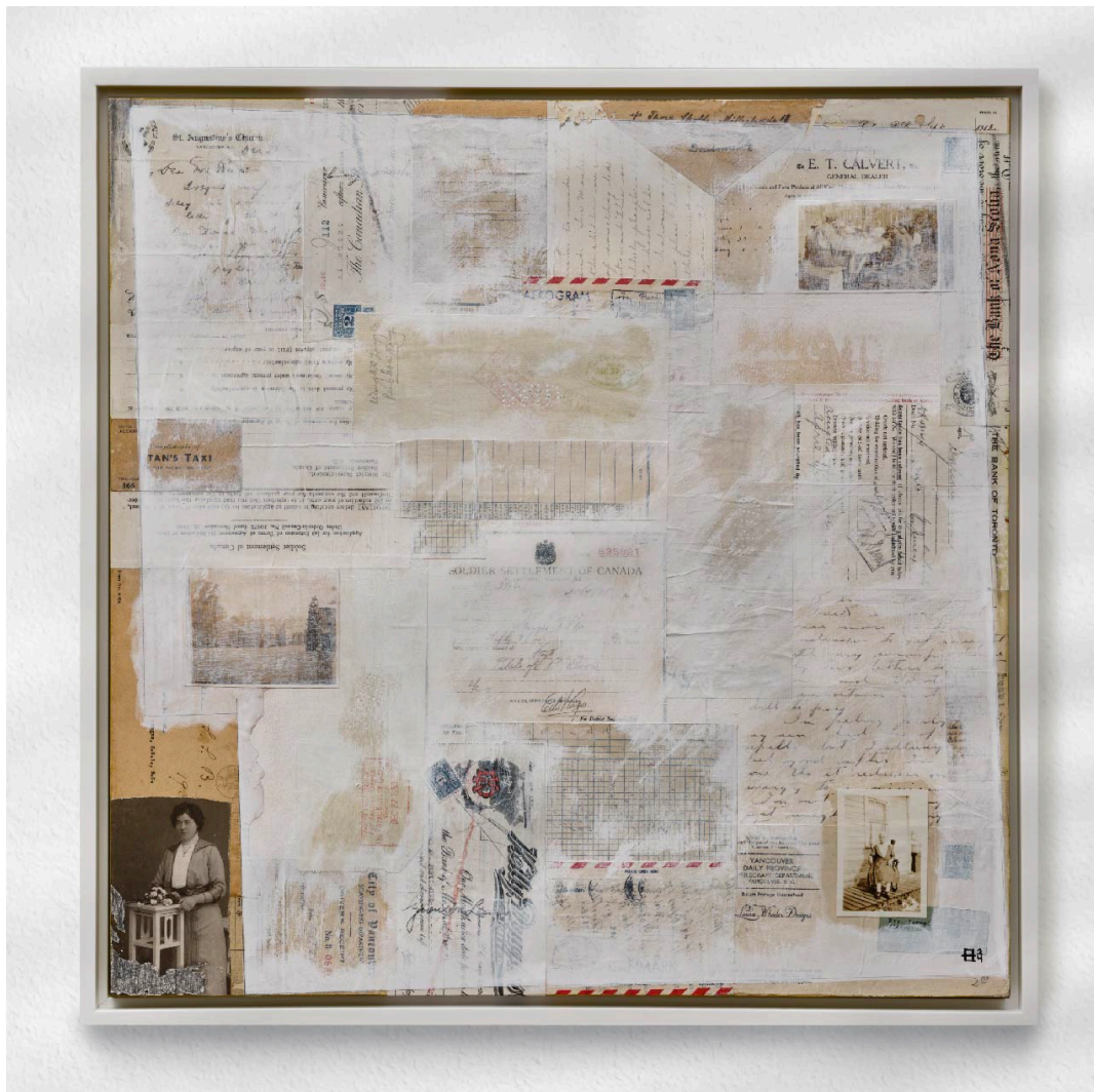
Anuar Heberlein From the series: Past / Present / Future (Auntie) Tante Heidi, 2024 Collage and acrylic on board 29" x 29" in (framed) $1,100

1100 Chestnut Street Vancouver, BC V6J 3J9