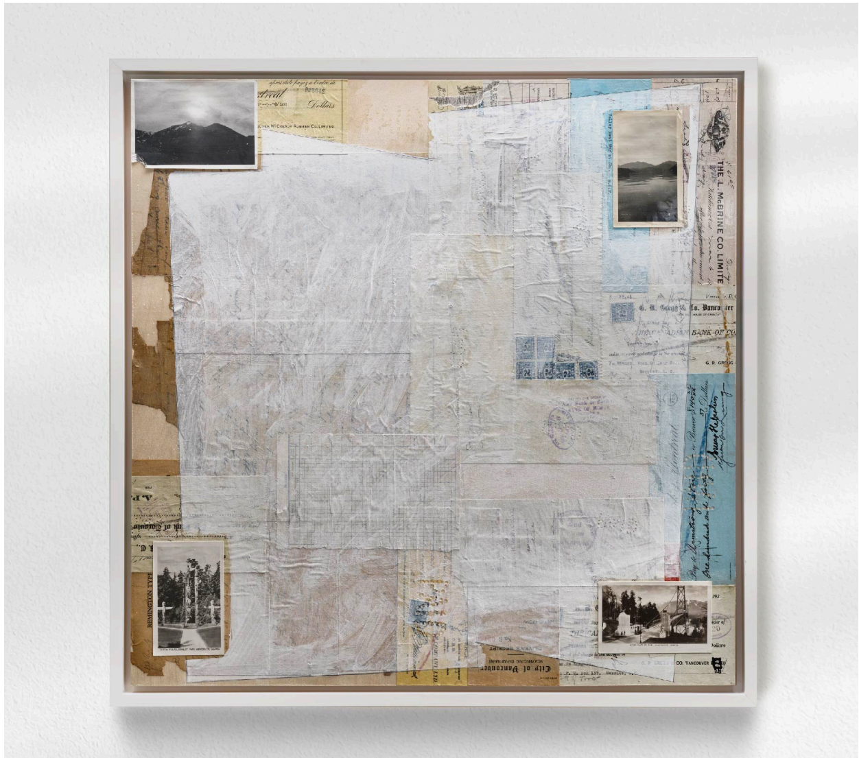
Anuar Heberlein From the series: Past / Present / Future Stanley Park, 2024 Collage and acrylic on board 29" x 29" in (framed) $1,100

1100 Chestnut Street Vancouver, BC V6J 3J9