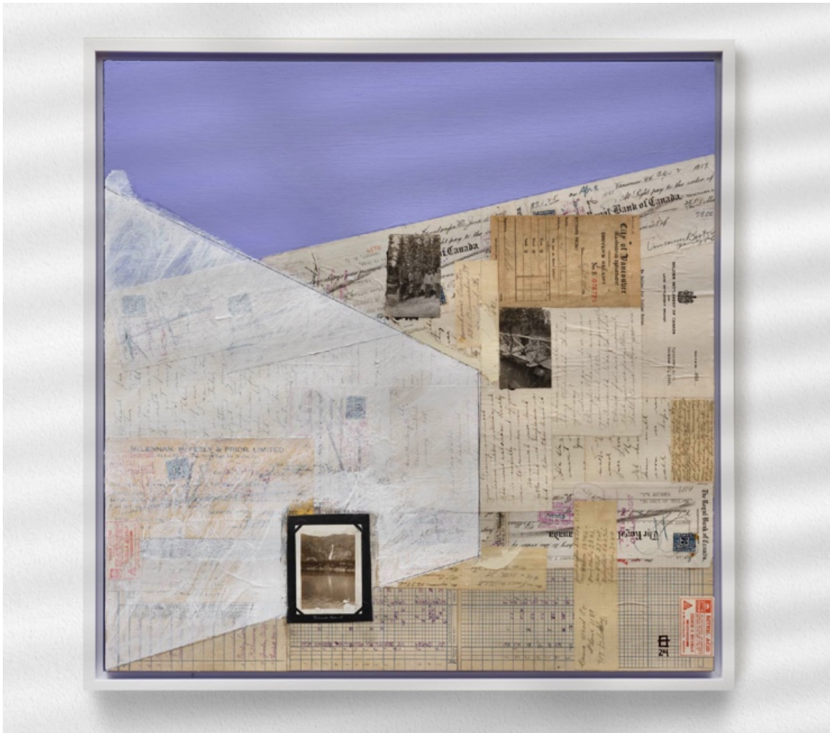
Anuar Heberlein From the series: Past / Present / Future Howe Sound (Homage to Barragán), 2024 Collage and acrylic on board 29" x 29" in (framed) $1,100

1100 Chestnut Street Vancouver, BC V6J 3J9