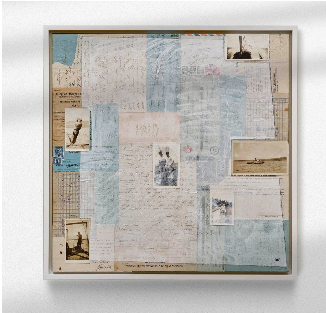
Anuar Heberlein From the series: Past / Present / Future Old Salt Harry, 2024 Collage and acrylic on board 29" x 29" in (framed) $1,100

1100 Chestnut Street Vancouver, BC V6J 3J9