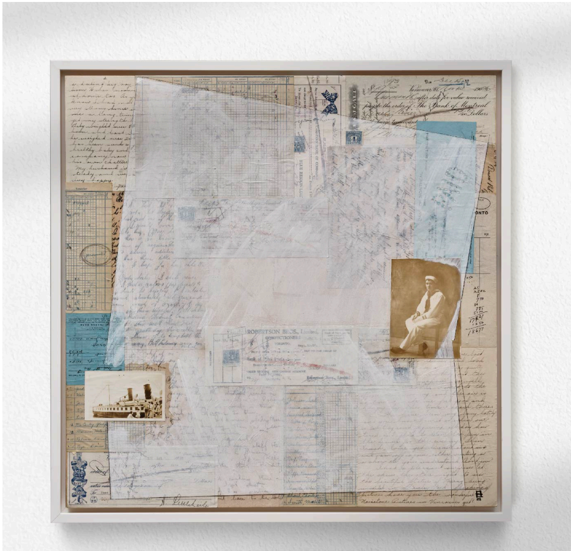
Anuar Heberlein From the series: Past / Present / Future Dearest Pal, 2024 Collage and acrylic on board 29" x 29" in (framed) $1,100

1100 Chestnut Street Vancouver, BC V6J 3J9