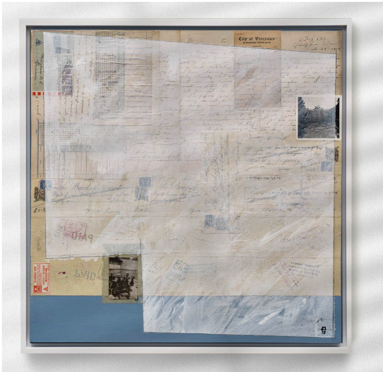
Anuar Heberlein From the series: Past / Present / Future Swimming, 2024 Collage and acrylic on board 29" x 29" in (framed) $1,100

1100 Chestnut Street Vancouver, BC V6J 3J9